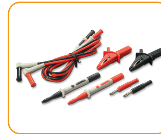
U1161A Extended Test Lead Kit