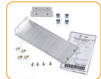
U3400A-1CM Rack Mount Kit

Pricing and technical data subject to change without notice.