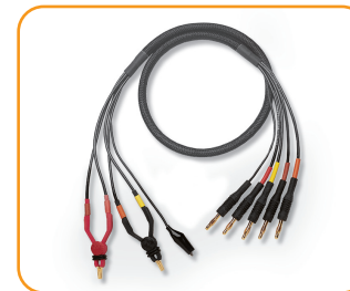
11059A Kelvin Probe Set