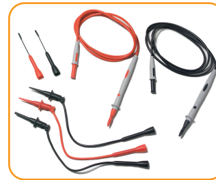
34138A Test Lead Kit