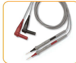
34133A Precision Electronic DMM Test Lead Kit